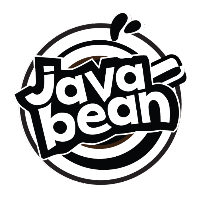
BLACK & WHITE